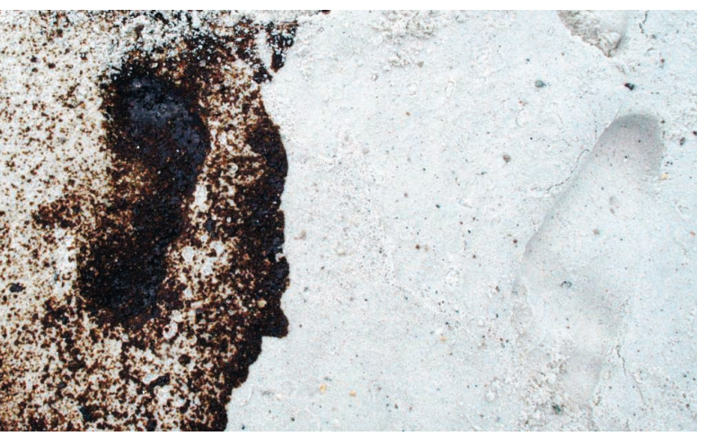
Creeping closer. Weeks after the April 2010 Gulf of Mexico oil spill began, a wave of oily tarballs washes over a footprint in Orange Beach, Alabama.

On campus, we have set up our own drilling rigs, drilling not for