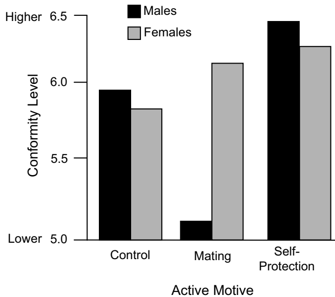
Fig. 2. Conformity as a function of activated motive. Both men and women are more conforming when self-protection motives are active (compared to a control condition). In contrast, activating mating motives leads men to become less conforming and, as discussed in the text, more creative and showy in other ways (results based on Griskevicius, Goldstein, Mortensen, Cialdini, & Kenrick, 2006).

2006; see Fig. 2). Mating motives lead women to become more agreeable and conforming—a characteristic men find especially desirable in a relationship partner. In contrast, mating motives incline men toward anticonformity—a behavioral display that can signal dominance and help an individual man stand out from the crowd of other men competing for favor among highly selective females.