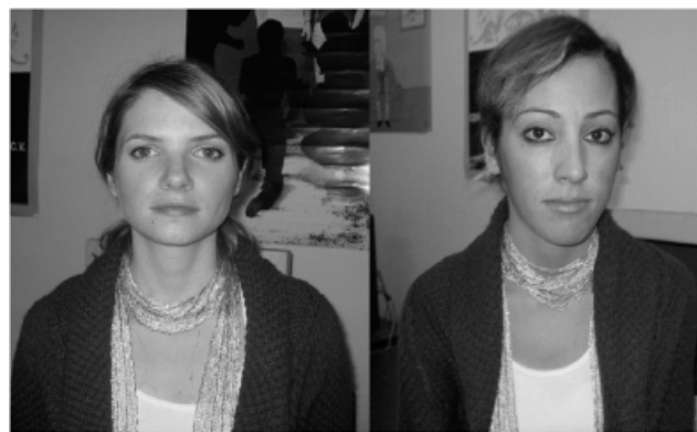
Fig. 1. The first experimenter from Study 1a and the experimenter who surreptitiously replaced her.

Participants in Study 1a were 81 Canadian-born psychology undergraduates (53 females and 28 males; mean age = 19.49 years, SD = 2.80 ). In all conditions, participants entered the lab, were greeted by an experimenter, and were then randomly assigned to one of three experimental conditions. In the control condition, participants answered questions about their entertainment preferences (the same control questions used in many terror management studies; e.g., Greenberg et al., 1995). In the changing-experimenter condition, while participants answered these questions about entertainment, the female research assistant conducting the experiment was surreptitiously switched with another, identically dressed female experimenter (see Fig. 1). The first experimenter went to a filing cabinet to retrieve the next questionnaire, and after opening the filing cabinet, she stepped back and was replaced by the second experimenter, who shut the cabinet and continued the experiment (a video of the change can be viewed on the Web at http://www.psych.ubc.ca/~heine/MMMSwitch.wmv ). In the mortality-salience condition, participants completed a standard mortality-salience manipulation by answering two questions about their own death (e.g., Rosenblatt et al., 1989). Previous studies have demonstrated that reminding participants of their eventual death